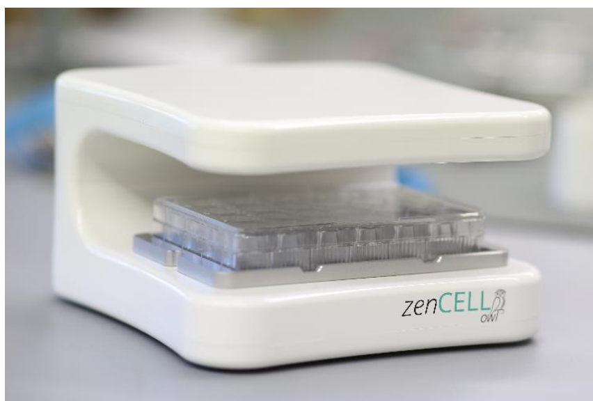
Figure 1: zenCELL owl. 24-channel microscope with 24-well cell culture plate.

The zenCELL owl is a 24-channel microscope designed for fast and automated cell culture microscopy. Combining stability and small size it is perfectly suitable for use in incubators. The modular design allows flexible configurations to ensure a secure analysis of biological samples. The small size leaves enough space in the incubator for other cell cultures or more zenCELL owl systems.